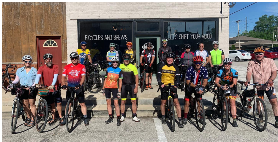
Great turnout at Rural Cyclery's gravel ride. Rural Cyclery, based in Winchester, is a corporate member of the SBC.

The SBC provided support at the Dirty Petersburg Gravel Ride.